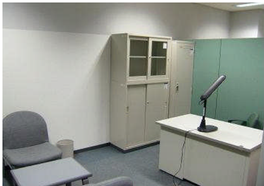
Inside view of a private office space

Please feel free to submit any additional attachments, such as those explaining business details, technologies and products, as reference materials.